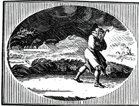
Wood engraving by Thomas Bewick